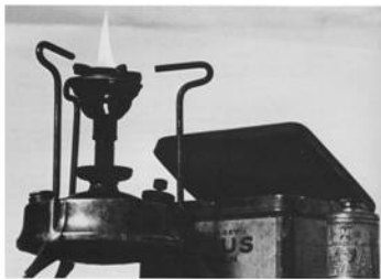
Rexroth's camping stove

Rexroth Festschrift Third Rail No. 8 www.literatureandarts.com/ rexcover.html