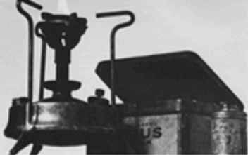
Rexroth's camping stove